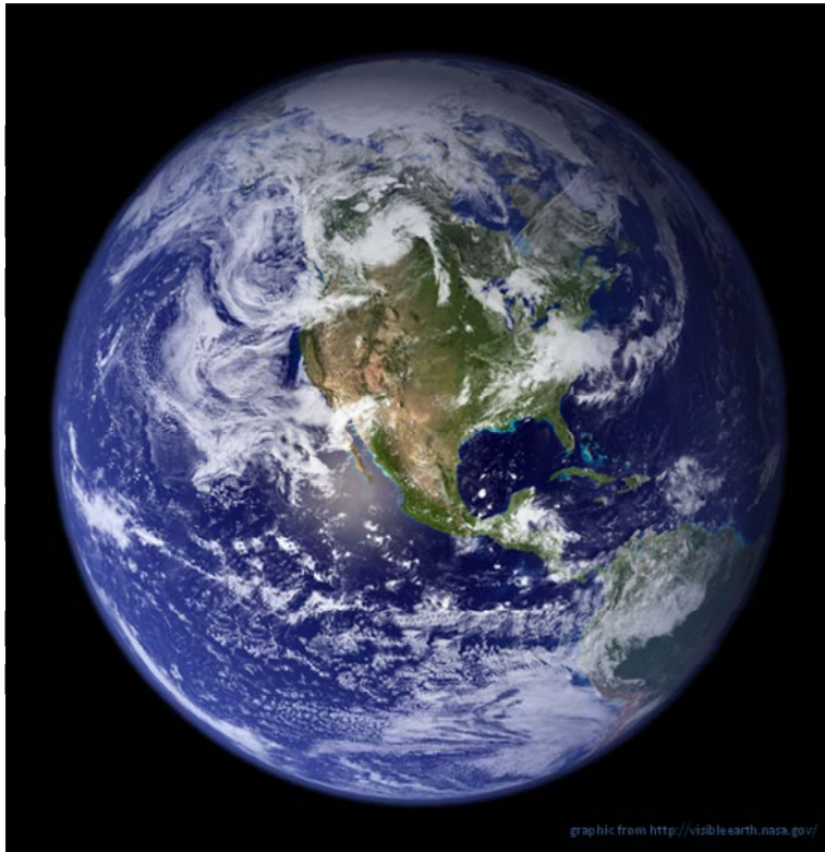
graphic from http://visibleearth.nasa.gov/